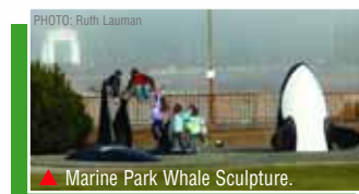
Marine Park Whale Sculpture.