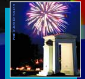
▲ Old Fashioned 4th of July Fireworks.