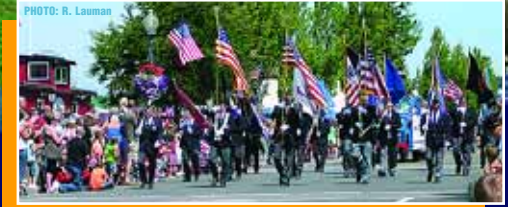
▲ Blaine "Rocks" every 4th of July with a grand parade attended by thousands.