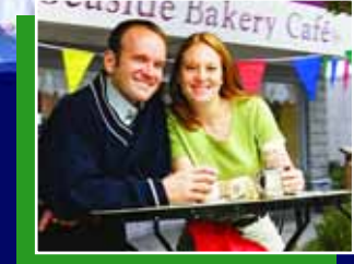
▲ Relax at a cozy café.

Every July the Blaine Jazz Festival gives teens a chance to study with internationally recognized jazz artists for 7 exciting days in a variety of workshops, rehearsals and concert performances. For more information visit www.pacificartsassoc.org