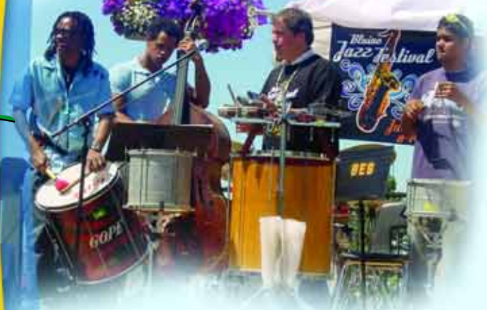
▲ The Blaine Jazz Festival performs free outdoor concerts.

Events are big in our small town! Celebrate migrating birds. Revel in a Sailing Regatta. Enjoy outdoor sculptures. Join with Canada to celebrate Hands Across the Border. Have a blast at our Old Fashioned 4th of July celebration. Snap to music at the Blaine Jazz Festival. Experience our maritime heritage during Drayton Harbor Days.