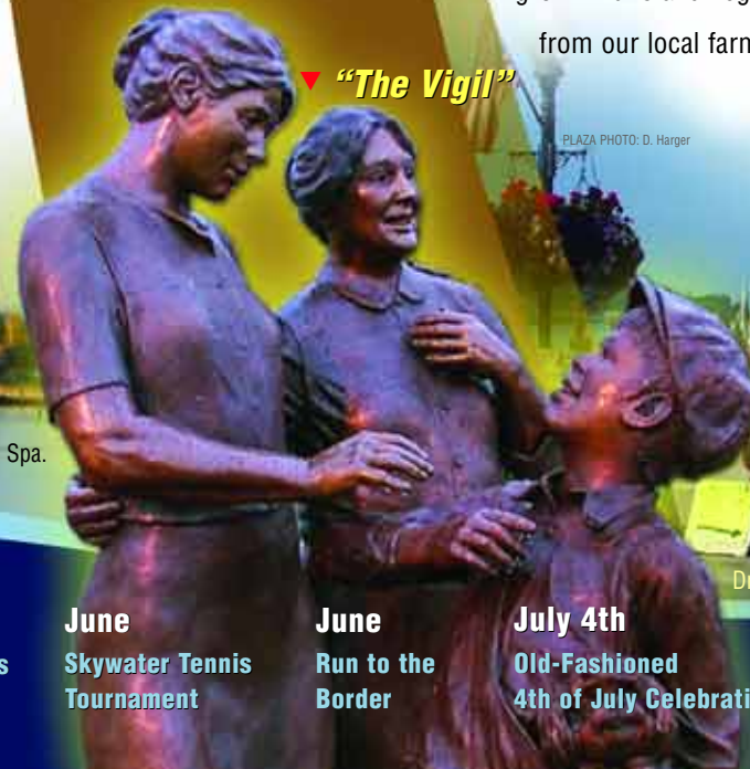
PLAZA PHOTO: D. Harger