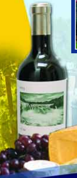
▲ Savor sips while wine tasting at two award winning wineries; Dakota Creek Winery and GLM Winery.