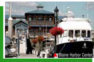
Blaine Harbor Center