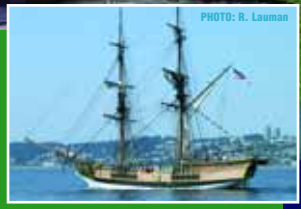
▲ The "Tall Ship" Lady Washington sailing across Semiahmoo Bay.