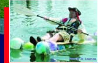
▲ Drayton Harbor Days.